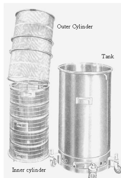
FIGURE 5 An Alwall dialyzer/ultrafilter. Cellophane tubing was wound around the mesh cylinder and a second, outer cylinder was added, restricting expansion of the tubing when internal pressure increased. Hydrostatic ultrafiltration became possible with restriction of tubing expansion. After both cylinders were assembled, they were inserted into the tank.

hydrostatic ultrafiltration became possible (Fig. 5). Dr. Kjellstrand was attracted to the treatment of renal failure with a dialyzer/ultrafilter. Professor Alwall created and became the head of the Department of Nephrology, which was Carl's first clinical rotation. The first, very ill, septic patient with acute renal failure whom Carl followed, recovered after 2 weeks of hemodialysis. Carl was so impressed that he wrote an obligatory medical case report on this patient and accepted a research assistant position. Shortly thereafter, Carl observed the use of hemodialysis in chronic renal failure. A